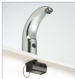
LTPS is easily mounted under counter.

LTPS End-of-Life Directives (Recycling): LTPS contains materials that are required to be recycled by specialized companies. Please ensure you dispose of your LTPS according to local regulations. Follow applicable laws and regulations for transport, shipping, and disposal of batteries. For details on recycling lithium-based batteries, and to find a recycling facility near you, please contact a government recycling agency, your waste-disposal service, or visit reputable on-line recycling sources such as www.call2recycle.org .