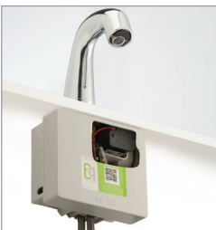
LTPS is integrated into the control box.